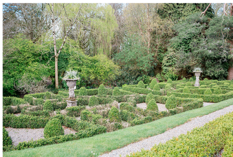
Marlfield House Venue Guide (Simple Tips To Benefit Your Wedding Photos)